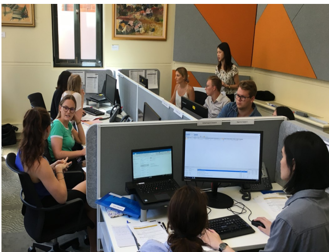
Clinic students taking part in induction and training activities prior to starting in the Law Clinic.