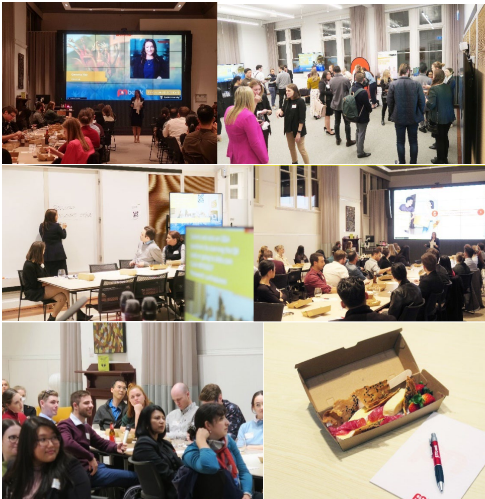
Wine + Cheese: Pinot and Property.