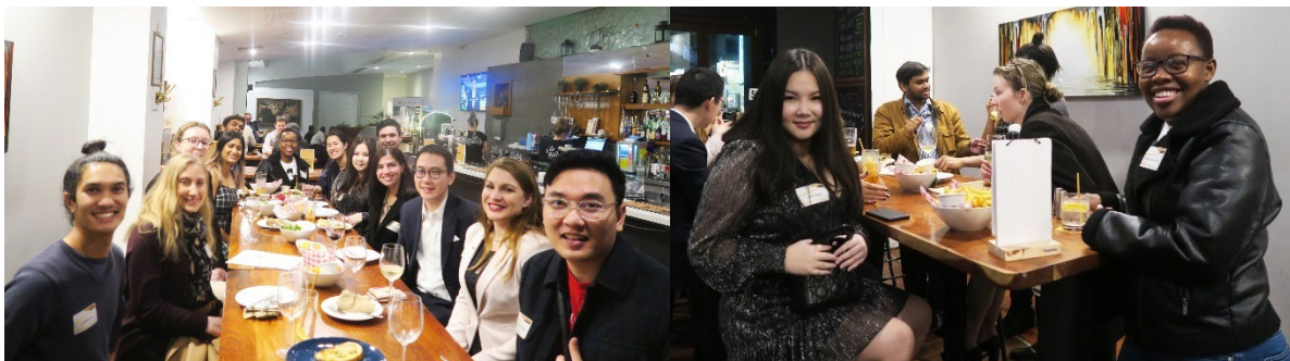
Cocktails and Conversations in July.

A mid-year Cocktails & Conversations function was held at Total BS. And Co, Perth. This casual event series brought together young grads from different industries, to share experiences and build connections.