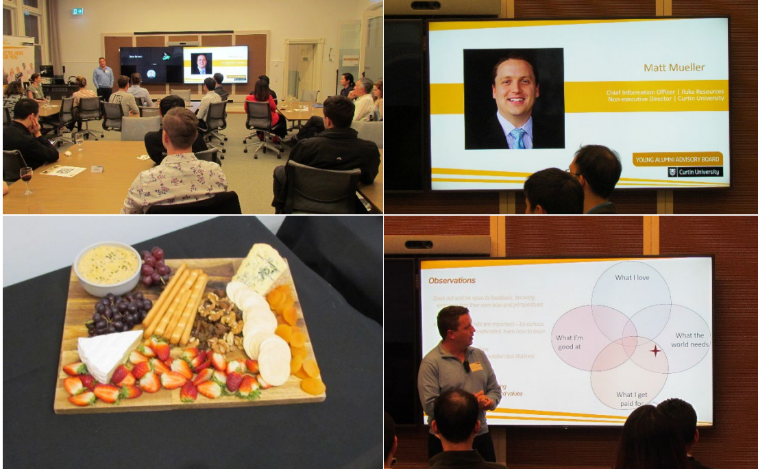
Wine + Cheese: Developing your professional growth mindset.