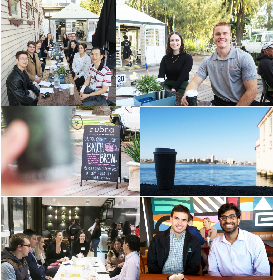
Coffee and Conversations in 2022.

The Coffee & Conversations event series continued to be the perfect before-work networking occasion for early birds. In 2022, these were held at Rubra on the Swan and Brew-Ha Kings Square café. In addition, the Curtin Young Alumni Advisory Board collaborated with Curtin's Law Alumni Society (CLAS), to host a Coffee and Conversations with law and tax graduates at Community Coffee, Perth. This was a great opportunity for young law graduates to come together and share industry insights, network and learn more about CLAS.