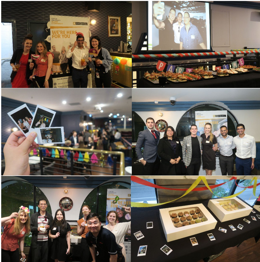
Celebrating five years of the Young Alumni Program.

We finished off the year by celebrating a special milestone – the Curtin Young Alumni Program turning 5! Held at the Glamour Bar at Prince Lane Perth, this event was a great opportunity to connect and reconnect with Curtin's young graduates. We celebrated the program's achievements and acknowledged current and former YAAB members. The event had some special surprises including a roving magician, cupcakes, and prizes! As the night wound down, many continued to catch up over light refreshments. It was a great way to come together and cap off a great year. We look forward to seeing more Curtin young alumni connecting at events in 2023.